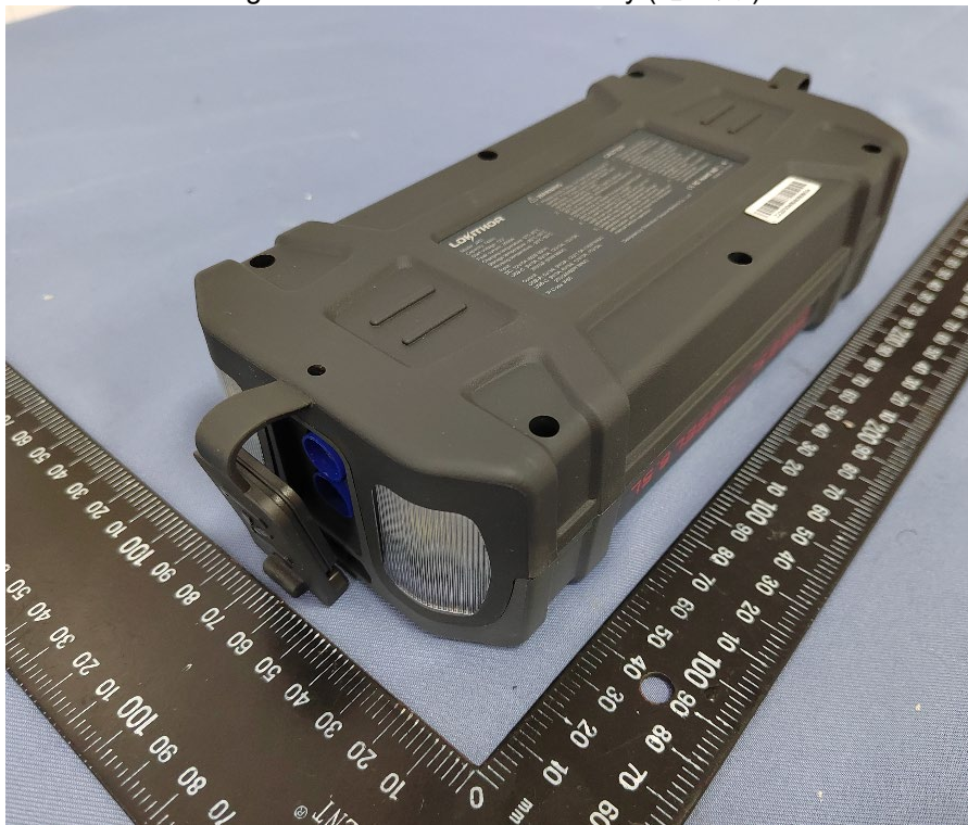
Figure 2 Overall view II of battery (电池图II)