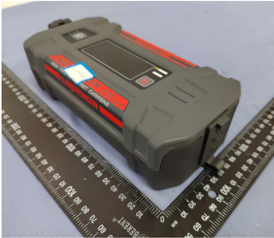
Figure 1 Overall view I of battery (电池图I)